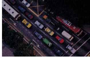
JVC Super LoLux™