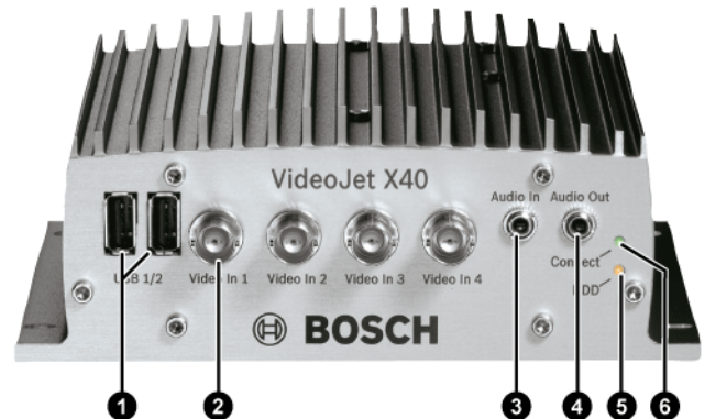
VideoJet X40 - front