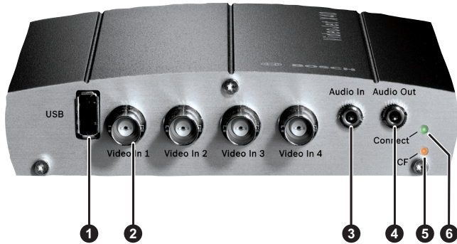
VideoJet X40 SN—front